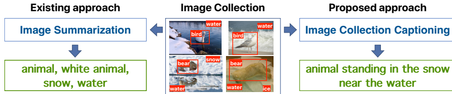
Fig. 1. Example of image summarization compared with image collection captioning: The left side shows the existing approach, in which the description is limited to words or noun phrases. The right side shows the proposed approach, in which an image collection is described in a single and refined sentence.

approaches are limited to summarizing an image collection only in the form of concept words or tag words. A recent work [24] presents a method for summarizing the texture, style, and material of similar objects in an image collection. Other works [22,32] summarize an image collection as a set of keywords. To be more informative in describing an image collection in semantic contexts, we propose image collection captioning to describe an image collection in the form of a single sentence. Fig. 1 shows the proposed task compared to the existing image summarization task.